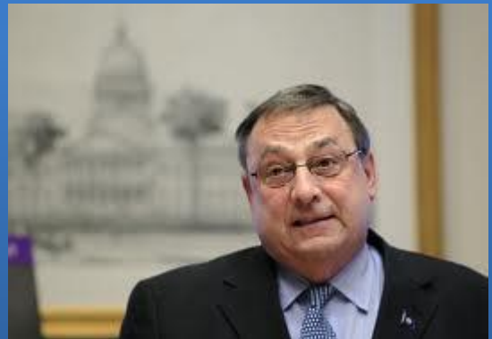
Maine Gov. Paul LePage

As in Maine, Mississippi voters face a voting-rights question under Initiative 27 , which would require that voters present picture IDs at the polls. Two other ballot initiatives in Mississippi touch on conservative hot-button issues, both of which could affect gubernatorial and