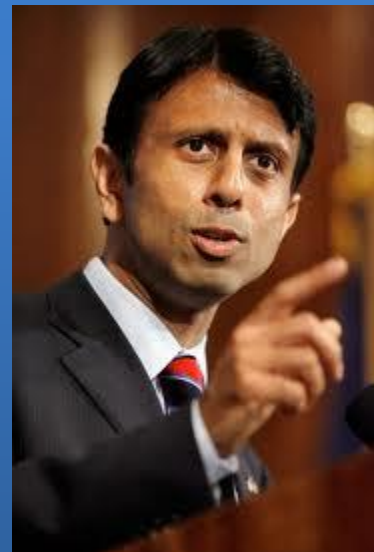
Louisiana Gov. Bobby Jindal