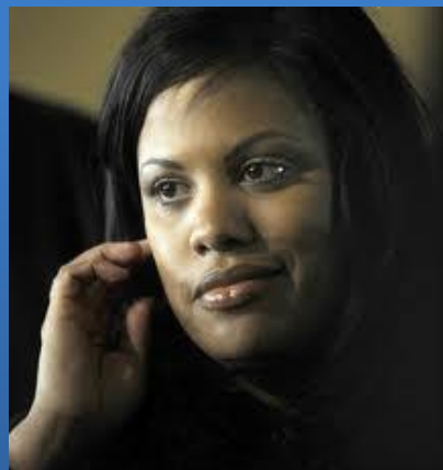
Baltimore Mayor Stephanie Rawlings-Blake