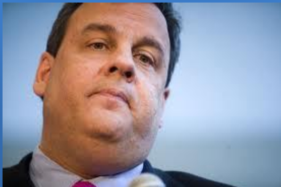
New Jersey Gov. Chris Christie